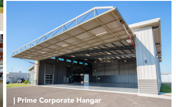
| Prime Corporate Hangar