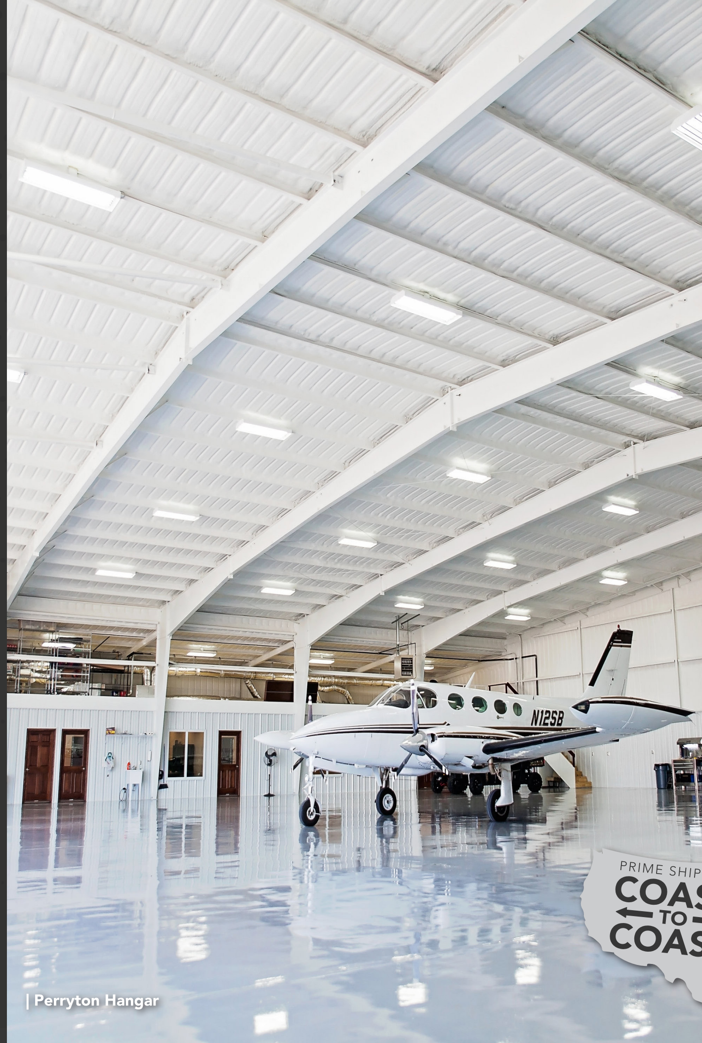
| Perryton Hangar