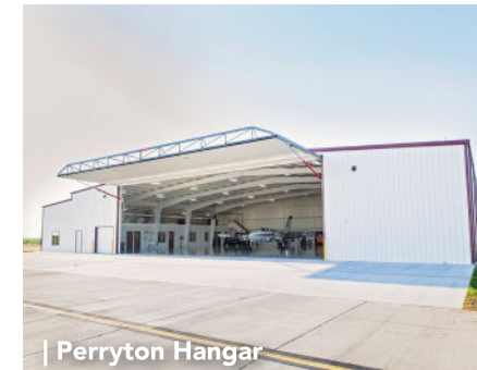
| Perryton Hangar