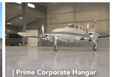
| Prime Corporate Hangar